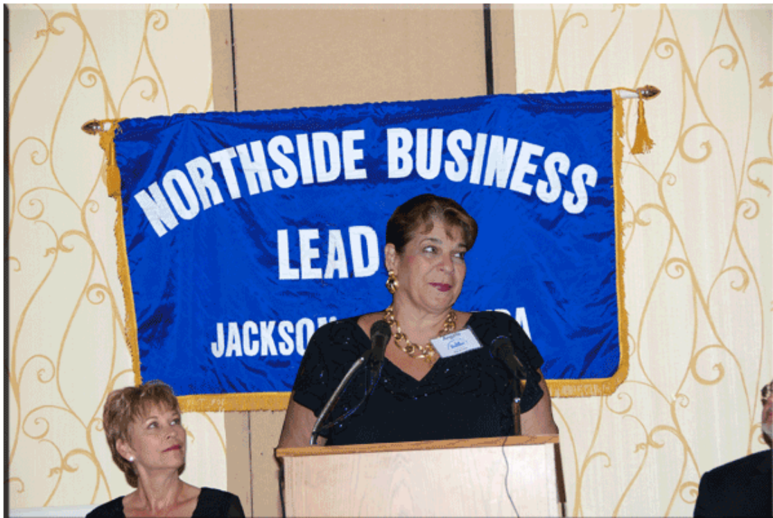
"Elected Official of the Year"