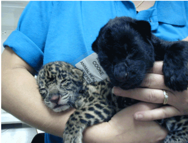
10th Birthday at the Zoo