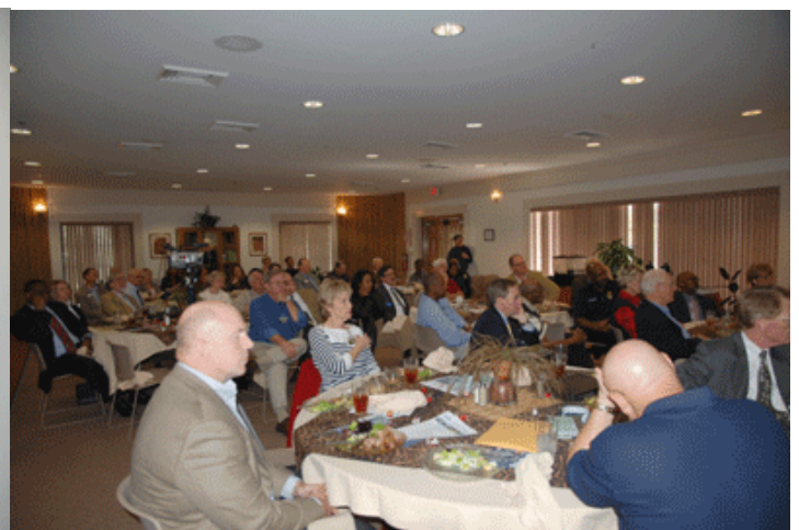
View of the Meeting