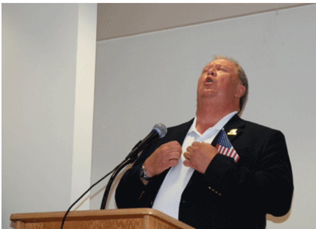
Reciting "Casey at the Bat"