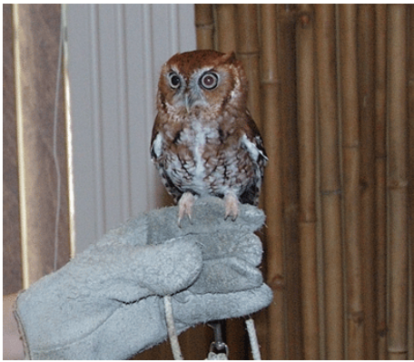
Special Guest, ...Owl