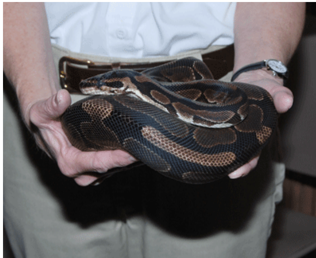
Our Special Guest...