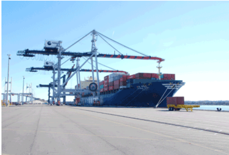
Panamax Ship Cranes

The JaxPort tour was very informative and everything is BIG! Our tour guide Joanne Kazmierski kept us busy the whole 90 minutes. She was very knowledgeable, professional, sweet and a really down to earth person. All of us on the tour were very impressed with what was going on at the port presently, but the future can put Jacksonville into a very prosperous situation.