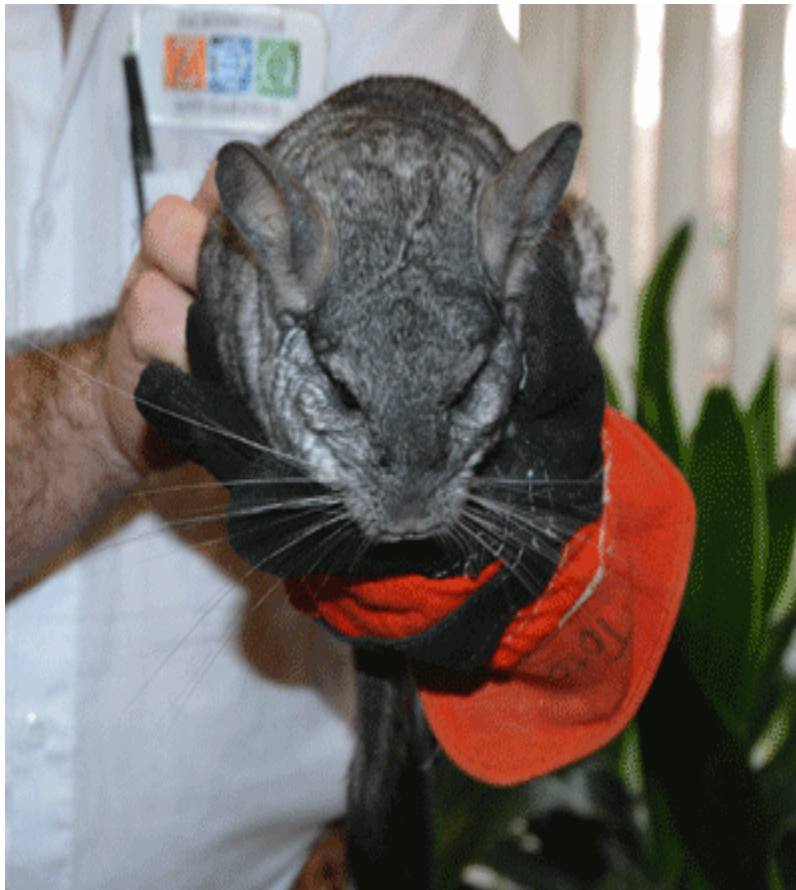
Special Guest, Toto the Chinchilla